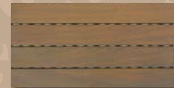
Double-C (24" x 12")