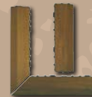
Clip on reducers for outside edges and corners