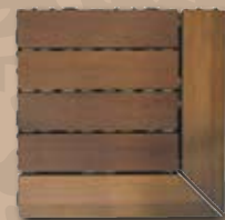
Corner reducers on tile

10 YEAR GUARANTEE: SwiftDeck tiles are fully guaranteed against faulty workmanship for a period of 10 years from the date of purchase. This guarantee however does not cover natural defects in the wood, misuse or if not installed and maintained as per manufacturer's recommendations.