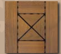
Sierra (12" x 12")