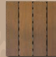
Colorado (12" x 12")

Wood species: Ipe (tabebuia sp.) Finish: pre-finished with protective oil. Plastic base: UV stabilized polyethylene. Packing: 12 tiles per box (6 for Double-C style)